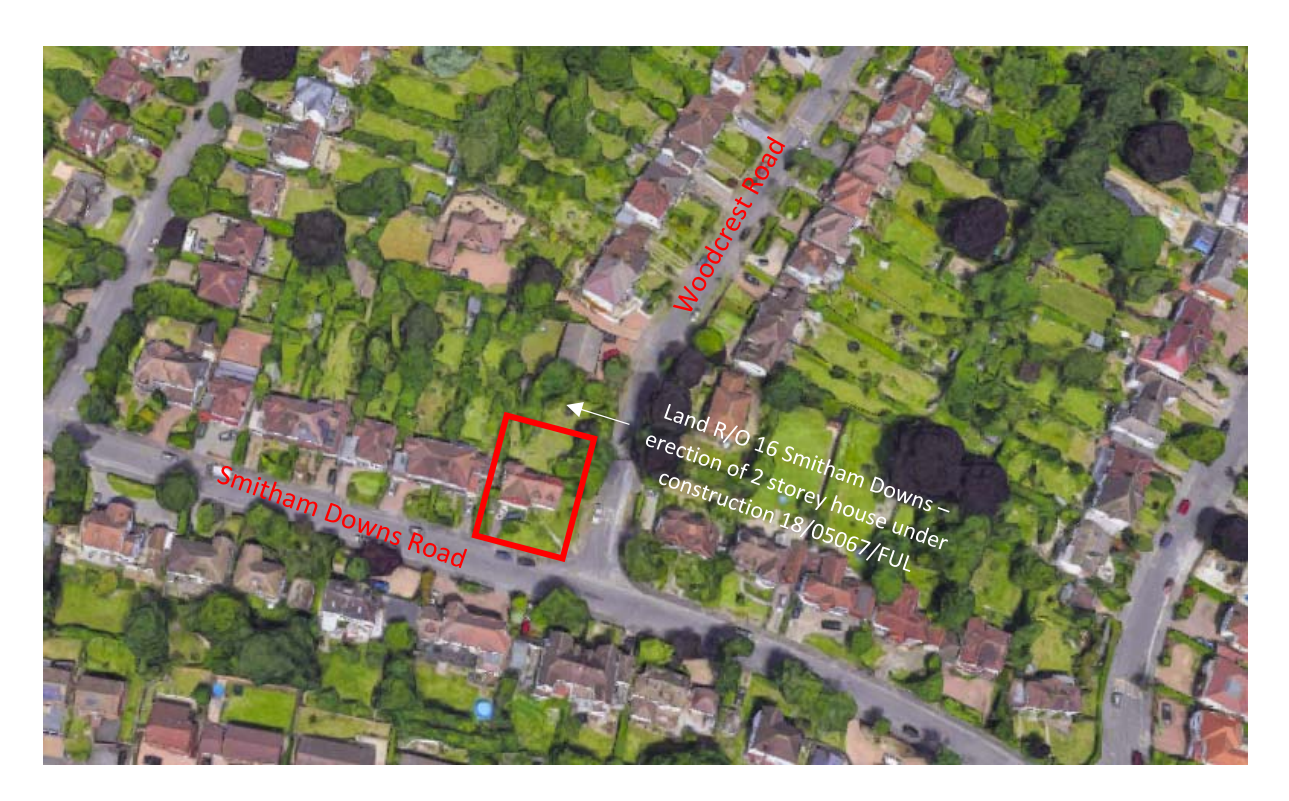
Aerial view of site