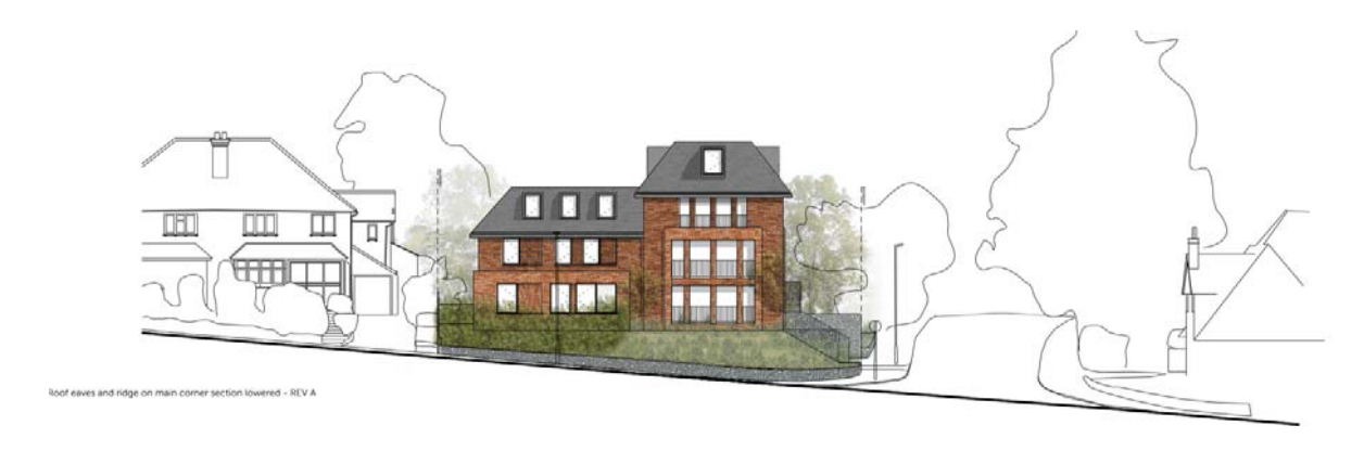
Proposed streetscene elevation (Smitham Downs Road)

8.8 The building lines on both street facing frontages are set well back, retaining the wide landscaped frontage on both sides. The proposed building lines respond well to their neighbouring properties on both Smitham Downs Road and Woodcrest Road – and better than the existing property on the plot. There is a gap of 1.8m to the site boundary on the western side and 2.5m to the boundary on the northern side (at the closest point). The retention of the raised grass verge is supported in principle as it enables the provision of underground car parking which reduces the need for surface car parking spaces on this fairly prominent corner site, allowing the green frontage to be retained and enhanced. The rear building line corresponds with the neighbouring property to the west and there is no breach of the 45 degree line in plan from this property. The proposed increase in footprint from the existing property on the site is concentrated on the Woodcrest Road frontage, away from neighbouring gardens to the west. In general, the mass of the proposed building in terms of height and footprint is considered to be acceptable.